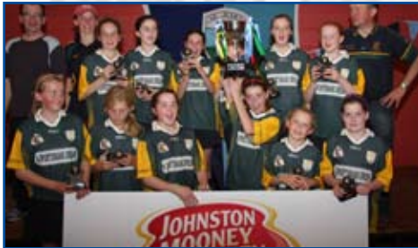
Toomevara Winners of the All-Ireland Under 13 Sevens

The under 12 champions 2008 from the Senior Camogie counties were invited to