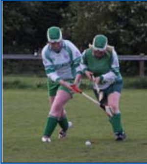
O'Dwyers - The Clash of the ash

Camogie clubs took an active role in the GAA's Lá na gClub held all over Ireland to celebrate the 125th anniversary.